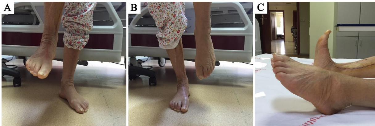
Figure 1. The power in the other muscle groups in the lower limbs

The knee reflex was normal bilaterally. The ankle reflex was mildly brisk on the left side and normal on the right side. There were no beats of clonus bilaterally. Sensation to light touch was decreased on the left side, normal on the right side.